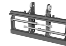
Fork positioning and sideshift