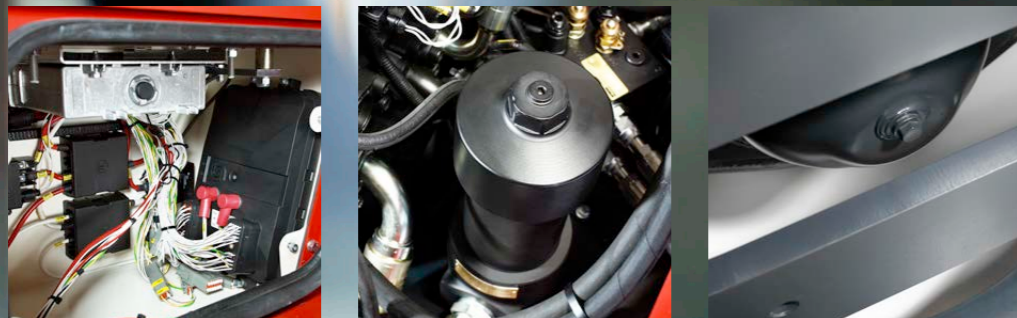
Service is fast, simple and convenient thanks to improved accessibility and smart features, like the hydraulic filters (middle) and a plug for filling shaft oil while standing (right).