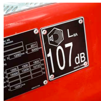
Reducing noise and increasing driving comfort and precision improves safety. This reduces risks of costly accidents occurring.