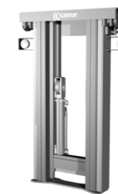
Triplex full free lift, free visibility