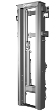
Duplex full free lift, free visibility