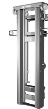
Duplex standard, free visibility