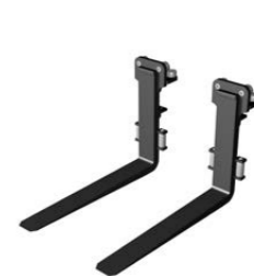
Roller fittings for hydraulic adjustment