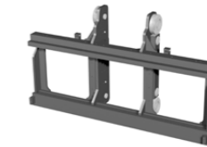
Fixed for manually moveable forks