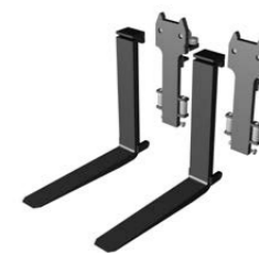
Fork shaft system with separate carriers for each fork