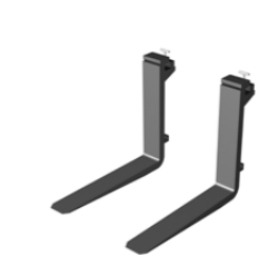
Forks for manual adjustment