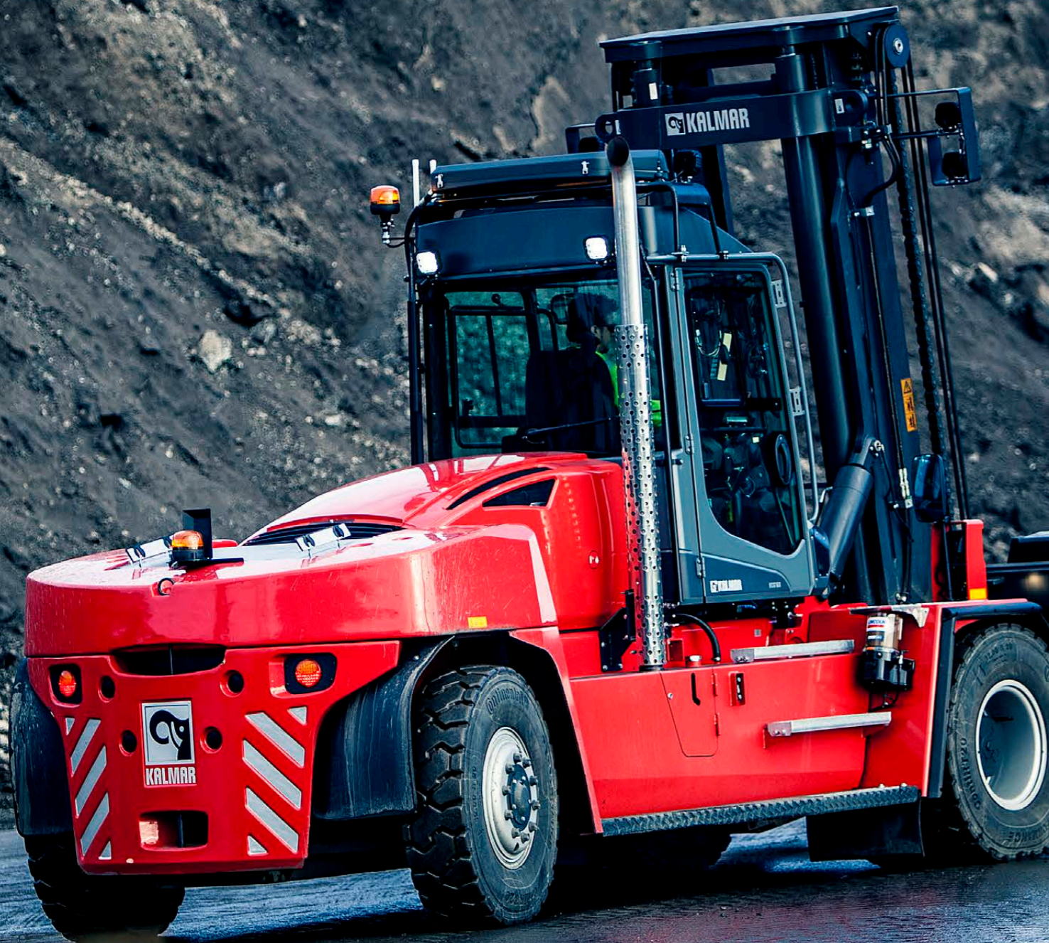
DUPLEX STANDARD, CLEAR VIEW

Kalmar offer you a complete range of standard and custom lifting equipment – carriage, fork shaft, forks, levelling, etc – and options to suit your specific lifting and cargo handling requirements.