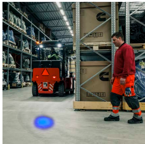
Blue safety light The blue safety light alerts people that the truck is approaching, reducing the risk of accidents.

In the unlikely event of a fire in the engine compartment the suppression system will automatically be activated to suppress the fire. A useful option in e.g. sawmill.